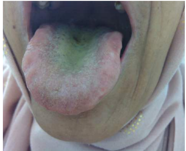
Figure 2. Macroglossia with bilateral dental impressions

Hypothyroidism is a common condition in the elderly and often under-diagnosed especially in its asymptomatic forms (subclinical hypothyroidism). [12] The diagnosis of depression associated with hypothyroidism is even more difficult, even in the overt forms of this endocrinopathy because these two conditions share several