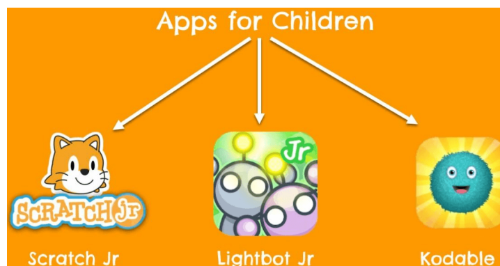
Figure 3 Apps for young age children to promote CT and coding skills

a small purchase cost. The previously mentioned programming environments belong to the category of mobile programming environments. In addition, young students can use Web-based programming environments in programming and the development of CT such as Kodable and the section for children who do not know how to read via the use of special applications such as Code.com (Zaranis et al., 2019). (see Figure 3)