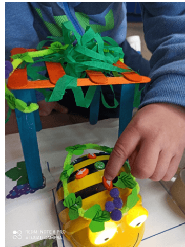
Figure 3 BeeBot

Marine Research (EL.KE.TH.E.) with the completion of the competitive European program “CLAIM” (Cleaning Litter by developing and Applying Innovative Methods in European Sea), financially integrated in Horizon 2020, appears that if we do not change habits immediately, by 2050, there will be more plastics in the sea than fish. More specifically, nine million tons of plastics leak into the oceans yearly. It is even estimated that 11,500 tons of plastics end up in the Greek seas yearly. Furthermore, everything that “ends up” in the sea does not stay there but returns to our bodies through the food chain, with each of us unintentionally consuming 5 grams of microplastics per week. The EL.KE.TH.E. estimates that 90% of beach litter is of plastic origin, with straws and bottle caps dominating. Plastic waste poses a serious risk to marine ecosystems, biodiversity, and human health and affects essential activities such as tourism, fishing, oyster farming and fish farming ( https://www.wwf.gr/ti_kanoume/anthropos/plastika/ ). (see Figure 4 )