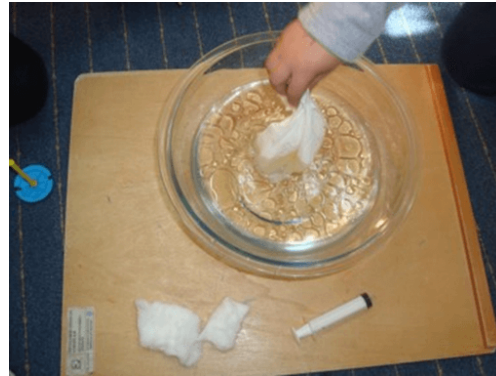
Figure 2 Experiment: Cleaning up the sea from an oil spill

process by creating a “bridge” between the child’s previous experiences and the focus of new knowledge (Thulin & Redfors, 2016). (see Figure 2)