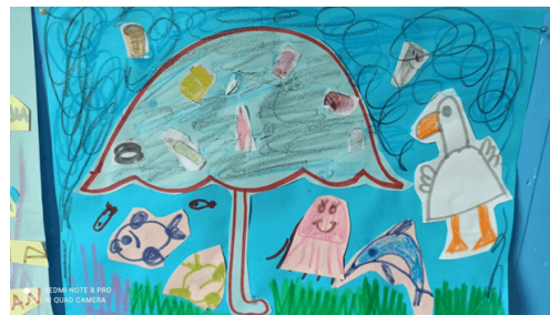
Figure 4 Save the seas from plastics

Marine Research (EL.KE.TH.E.) with the completion of the competitive European program “CLAIM” (Cleaning Litter by developing and Applying Innovative Methods in European Sea), financially integrated in Horizon 2020, appears that if we do not change habits immediately, by 2050, there will be more plastics in the sea than fish. More specifically, nine million tons of plastics leak into the oceans yearly. It is even estimated that 11,500 tons of plastics end up in the Greek seas yearly. Furthermore, everything that “ends up” in the sea does not stay there but returns to our bodies through the food chain, with each of us unintentionally consuming 5 grams of microplastics per week. The EL.KE.TH.E. estimates that 90% of beach litter is of plastic origin, with straws and bottle caps dominating. Plastic waste poses a serious risk to marine ecosystems, biodiversity, and human health and affects essential activities such as tourism, fishing, oyster farming and fish farming ( https://www.wwf.gr/ti_kanoume/anthropos/plastika/ ). (see Figure 4 )