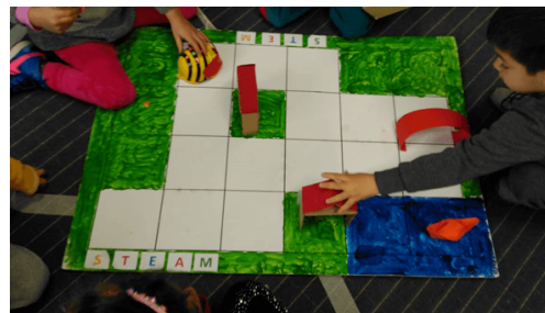
Figure 1 STEM and robotics

Effective STEM education should capitalize on students' initial experiences and interests and build new knowledge on top of what they already know without forgetting that students should acquire holistic development through interesting science practices (NRC, 2010). (see Figure 1)