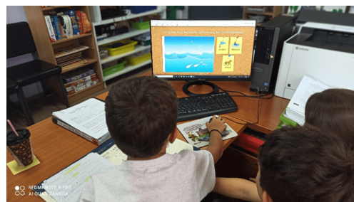
Figure 5 Digital quiz

Students are then asked to collect information on the topic at home from the computer, using the Junior Safe Search ( https://www.juniorsafesearch.com/ ), from books, from discussions with their parents, and after recording them using multiple forms (painting, pictures, words, tables, etc.), they upload them to a padlet board prepared by the teacher https://padlet.com/dashboard . (see Figure 5 )