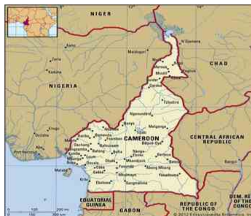
Figure 1. Cameroon Map

elephants, giraffes, hippopotami, and rhinoceros in this area. Maroua has a large market for crafts and museums. The provinces of Adamawa, North, and South offer a new front for tourism industry growth, but weak transport conditions in these regions hold the industry small. Southern forest reserves have little tourist-oriented facilities, but tourists can see primates, lions, gorillas, and other fauna in the rainforest. (see Figure 1)