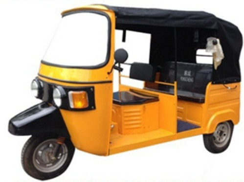
Figure 1. Image of a tricycle

This study was conducted in Maiduguri, the Borno state capital, located in North-eastern Nigeria. Borno state is located between latitudes 10°30' and 13°50' north and longitudes 11.00° and 13°45' east, with a total land area of 69,435 km 2 [24] . It has a population of 540,016 consisting of 282,409 males and 257,607 females [25] . It is a cosmopolitan town consisting of the indigenous ethnic group, the Kanuris and other ethnicities from the state and other states in northern Nigeria and even other parts of the country. An image of a tricycle is presented in Figure 1 .