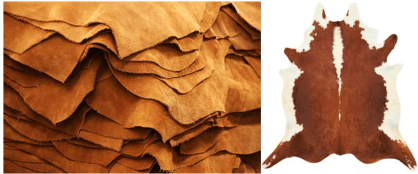
Figure 1 Nature and quality of leather