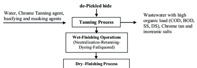
Figure 3 Schematic diagram of the environmental impact associated with tanning process

The main threat to the environment results from the dumping of liquid and solid waste that contains leftover chromium. In some commercial operations 50% of the chromium used in the tanning process is finding its way into the local environment. The run off and scraps are then consumed by animals and subsequently by humans: 25% of the chickens in Bangladesh were found to contain harmful levels of hexavalent chromium [21].