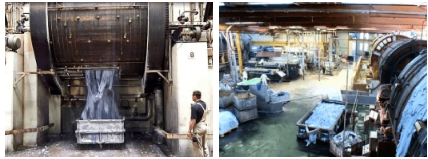
Figure 2 Chrome tanning in the tanning drum