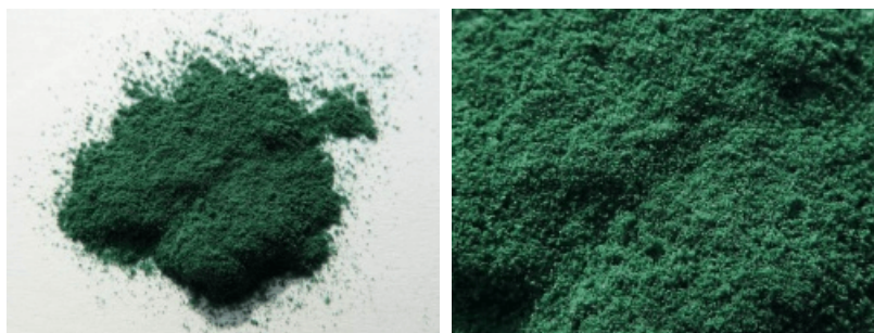
Chromium (III) oxide in powder form.

When the Leather is tanned by chrome powder then the process is called chrome tanning & material called chrome tanning. The use of chromium (III) salts is currently the commonest method of tanning. In the following decades, chrome tanning became the most common and dominant form of tanning. One of the main reasons why it was adopted so rapidly is that the process was much faster than vegetable tanning. The invention of chrome tanning coincided with the discovery of the fat liquoring (regressing) process and also the development of synthetic dyes. Together these changes to the chemistry of leather production led to chrome tanning becoming the preferred method. Chromium salts belong to the group of mineral tannins. Immediately after tanning, the leather is still wet and is tinged with blue, hence it is also referred to as wet blue [17].