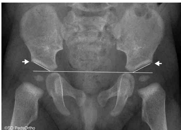
Note: Two surgeons felt that this patient had DDH that should be treated and the other three surgeons felt that this patient did not have DDH and required no treatment. This patient was treated with a Pavlik harness for 12-18 hours per day for four months.