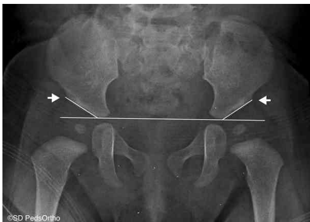
Note: All five surgeons blinded to whether or not this patient received treatment agreed that this patient had DDH that should be treated based on this x-ray. This patient was ultimately treated with a Pavlik harness full time for three months, then transitioned to a hip abduction brace to be worn full time for an additional month. The brace was then recommended for nights and naps for an additional six months.